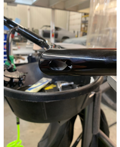
Access hole in bottom of handlebar.

20. Install handlebars and handlebar clamp. Torque handlebars to 18-22 ft. lbs