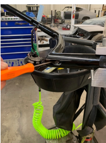
If needed, use a 90° dull pick to help guide wires around corner.