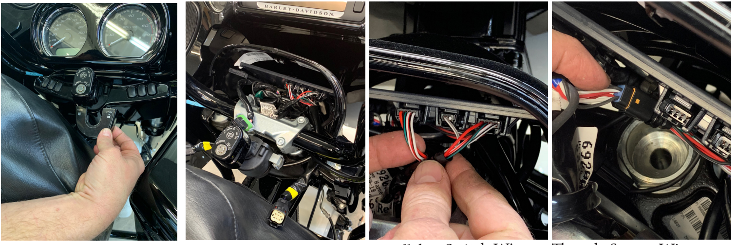
Handlebar Switch Wires

6. Unplug 3 handlebar wires and throttle sensor wire.