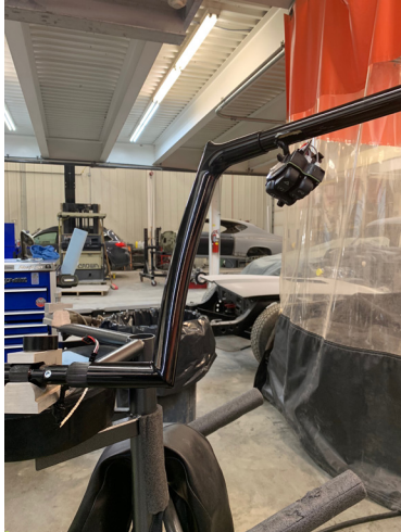
Right switch wires pulled through right handlebar.

• Make sure throttle tube notches are lined up with handlebar.